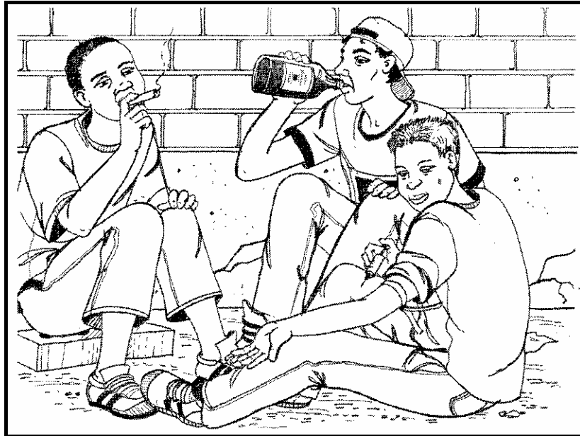
[Polelo ke lehumo 12 Macmillan]