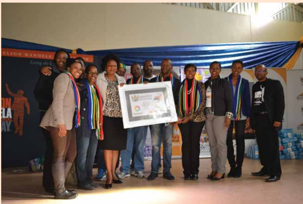
Proudly South Africans keeping the girl child at school

Bravo to Imbumba Foundation, Trek4Mandela, Caring4Girls and all men, women and institutions who have added their names to the call to improve the lives of our girl children.